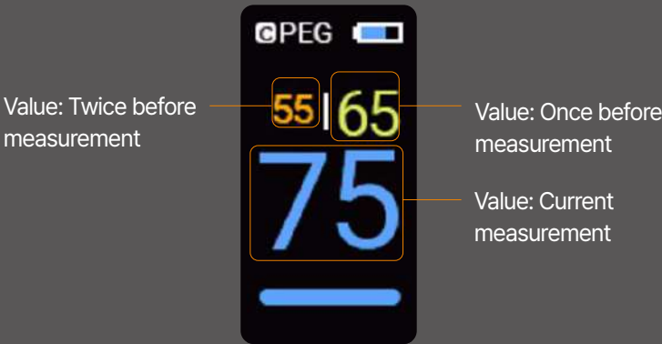
Intuitive color display